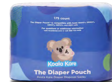
Diaper Pouch Cartridge

The Diaper Pouch is a cartridge containing 175 diaper disposal sacks that easily fits into one of the liner dispensers of any KB200 or KB300 platform changing station. This helps get rid of unsightly used diapers and reduces odors by providing users a means to properly dispose of diapers.