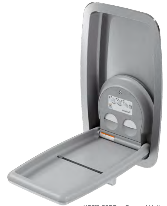
KB311-SSRE — Opened Unit