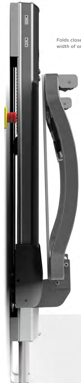
Folds closed to a width of only 20"