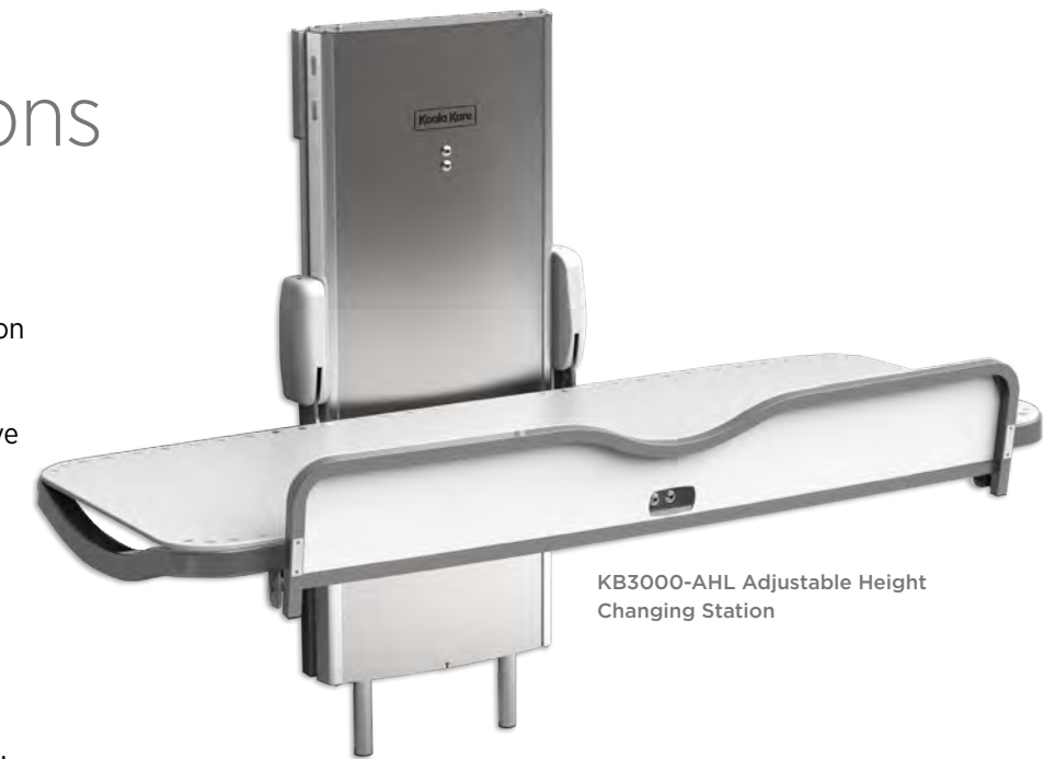
KB3000-AHL Adjustable Height Changing Station

Koala Kare understands that accommodation in the restroom goes beyond just changing stations for small children. With an extensive portfolio that now includes an adjustable height changing station suitable for adolescents and adults, a child protection seat, and a dual-height floor-anchored retractable step stool, Koala Kare can help any restroom meet the needs of all families.