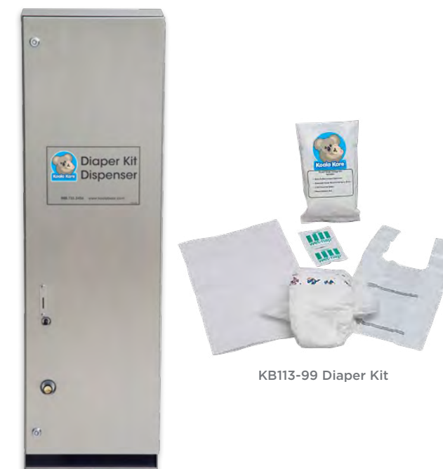
KB113-99 Diaper Kit