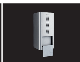
double toilet roll holder PU-300