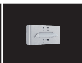
tissue dispenser PU-190