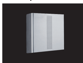
paper towel dispenser PU-100