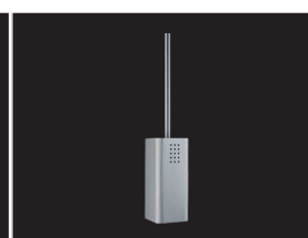
toilet brush holder PU-500