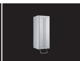
soap dispenser PU-140